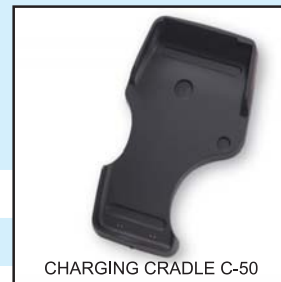
CHARGING CRADLE C-50